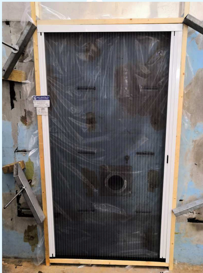
Photograph of the sample.

(*) according to that stated by the Customer.