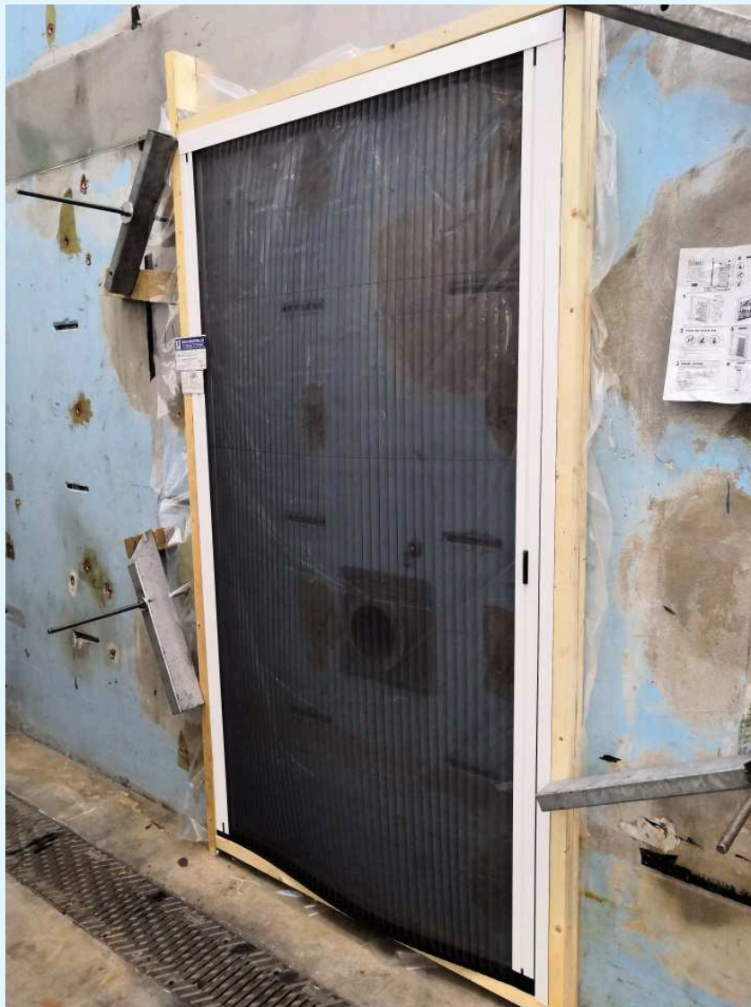
Photograph of the sample during test.