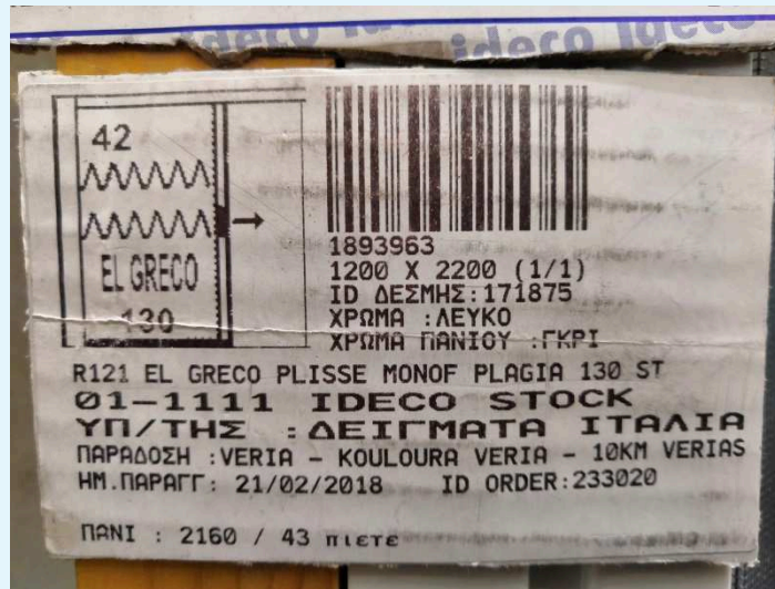
Detail of the label.