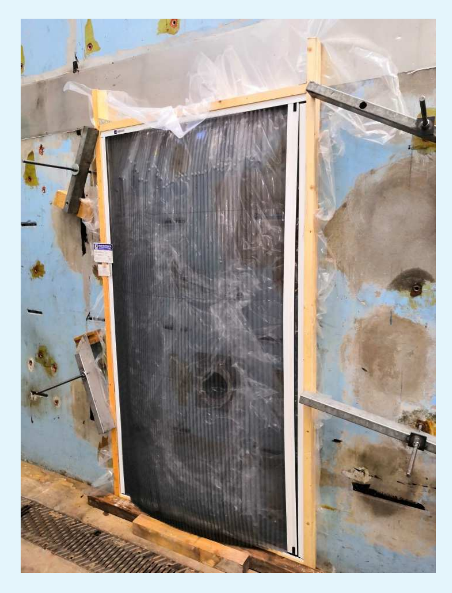
Photograph of the sample during test.